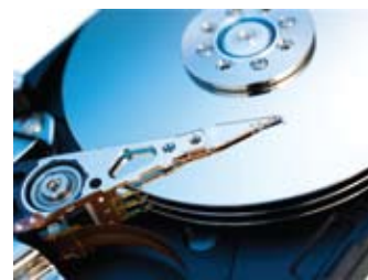
Edenvale Technology Park 1976