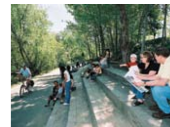
Guadalupe River Park & Gardens 2005