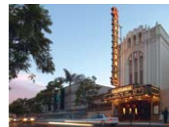
California Theatre 2004