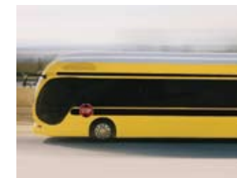
Clean Technology 2008