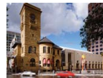
San Jose Museum of Art New Wing 1991