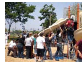
Strong Neighborhood Initiative (SNI) Project Area Adopted 2002