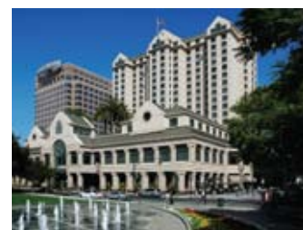
Fairmont Hotel 1987