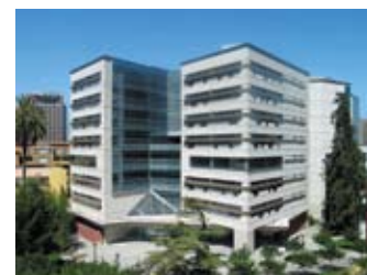
Dr. Martin Luther King Jr. Library 2003