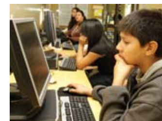
Starbird Youth Center 2007