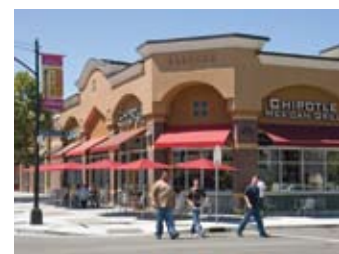
Neighborhood Business District Program Created 1984