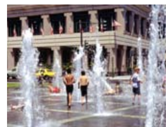
Plaza de César Chávez Park 1989