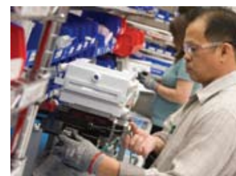
Rincon de Los Esteros Technology Park 1974