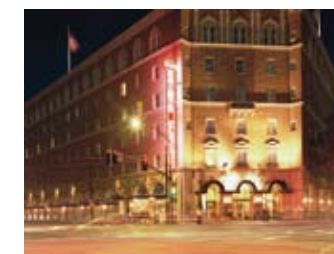
Sainte Claire Hotel Renovation 1992