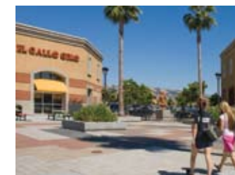
Plaza de San José 2005