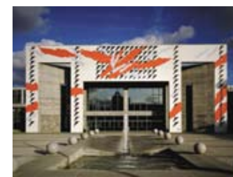
San Jose McEnery Convention Center 1989