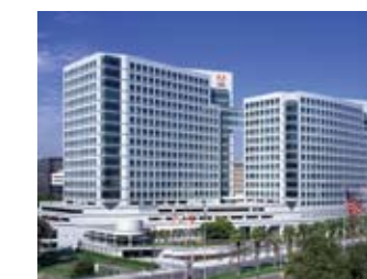
Adobe Systems Headquarters West/East Towers 1996/1998