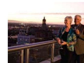
High-Rise Housing 2009

view more projects at sjredevelopment.org