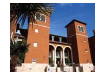
Villa Torino Housing 1997