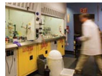
San Jose BioCenter 2004